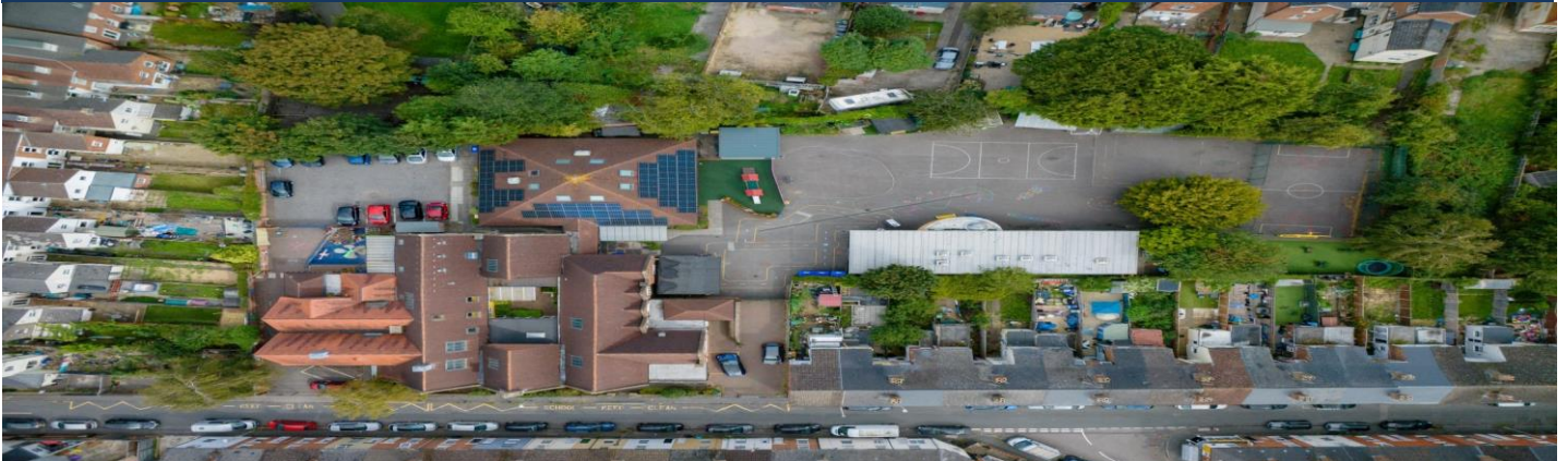
St Paul's C of E Primary School & Nursery, New Street, Gloucester, GL1 5BD Tel: 01452 521872 email: admin@st-pauls.gloucs.sch.uk www.st-pauls.gloucs.sch.uk